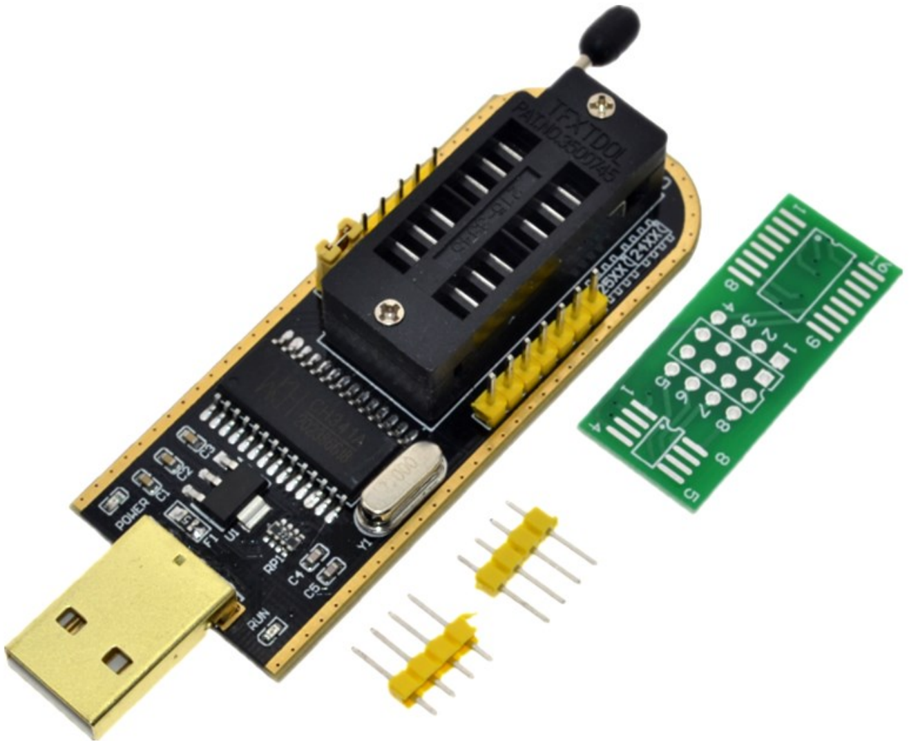
89 Series Device Programmer Usb Driver